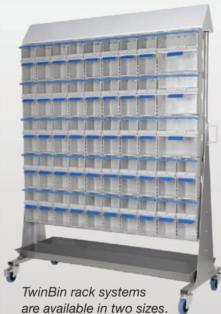
TwinBin rack systems are available in two sizes.

Our VMI uses the proven TwinBin® system, that works by storing reserve stock above active stock. Once the active stock has been depleted, pull the slider to release the reserve batch readying the upper chamber for new stock.