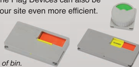
BinFlags and SpinFlags can be fixed onto any type of bin.

When the slider is pulled, a Flag will pop up displaying red, so the store manager can quickly identify the parts that need to be re-ordered. The flag can be set to yellow so everyone knows the 3rd batch is on the way after the bin has been scanned. The Flag Devices can also be made RFID compatible to make your site even more efficient.