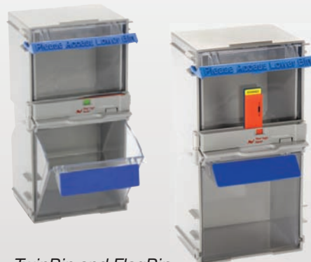
TwinBin and FlagBin units with TiltBin dispensers.

When the slider is pulled, a Flag will pop up displaying red, so the store manager can quickly identify the parts that need to be re-ordered. The flag can be set to yellow so everyone knows the 3rd batch is on the way after the bin has been scanned. The Flag Devices can also be made RFID compatible to make your site even more efficient.